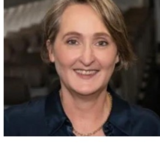
Vanessa Hudson CEO Qantas