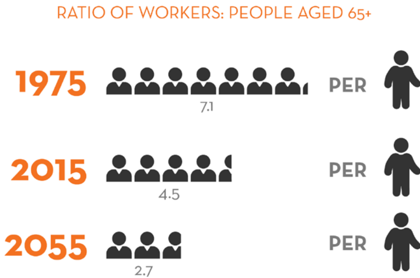
Figure 2: Australia’s declining workforce ratio

The ratio of workers to the number of people aged over 65 is declining significantly. While in 1975 there were 7.1 people in the working age population for every person of retirement age, this is projected to decline to just 2.7 people by 2055. 19